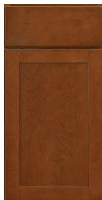
Lanston Gunstock Foil