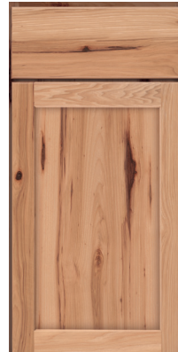
Arbon Rustic Hickory