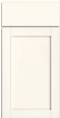
Lanston White Foil

For this project we have selected the in-stock Cardell Concepts Lanston White cabinetry. The following additional door styles and finishes are available but may need to be special ordered.