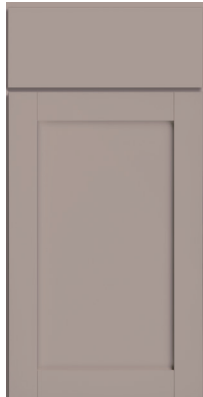
Lanston Grey Foil