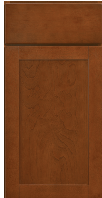
Lanston Gunstock Foil